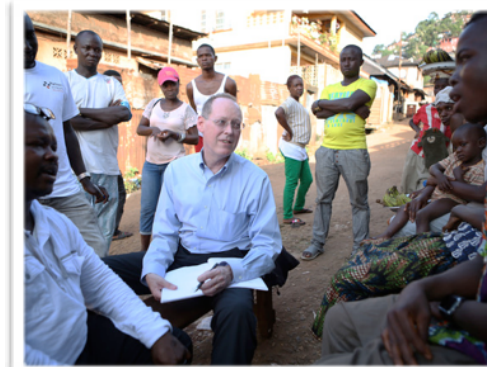
Dr. Paul Farmer meets with Ebola survivors in Freetown, Sierra Leone.