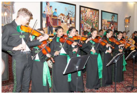
Figure 1: Mora High School Mariachi Band performs at Welcome Reception