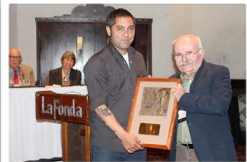
Figure 5: SfAA Award Ceremony