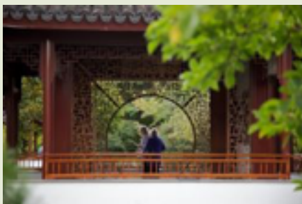
Photo credit: Dr Sun Yat Sen Garden Tourism Vancouver/ Canadian Tourism Commission (CTC)

The official languages of Canada are English and French, but in Vancouver you're more likely to hear English mixed with Cantonese, Mandarin, Punjabi, Tagalog and Korean - just a few of the 70-plus languages spoken here. This blend of international cultures is why Vancouver is acclaimed as such a welcoming and colorful destination, boasting an unprecedented range of culinary adventures, cultural attractions and shopping experiences.