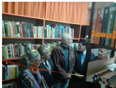
The SfAA Donates Anthropology Books & Journals to the National University of the Altiplano; Puno, Peru