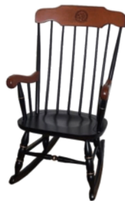
Picture of the Sol Tax Award