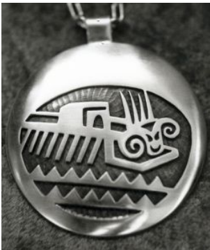
Picture of the Malinowski Award

The Society for Applied Anthropology considers each year nominations for the Malinowski Award. This Award is presented to a senior social scientist in recognition of a career dedicated to