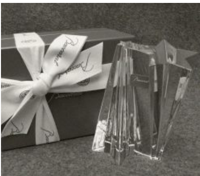
Picture of the P.K. New Award