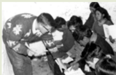
PCV in Chijnaya, Peru (62-65).