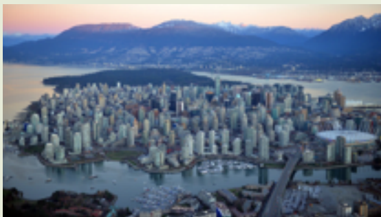
Vancouver, B.C., Canada

After a very successful 75th birthday for the Society for Applied Anthropology, we have another birthday in store: the SfAA Podcast Project! The 2016 Annual Meeting in Vancouver will mark a decade of recording and archiving select conference papers to the public.