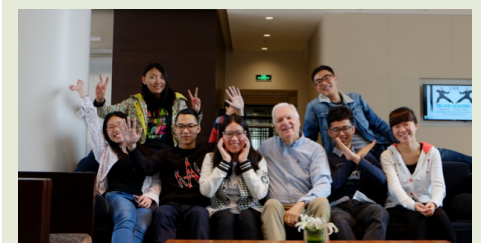
Some of the undergraduate medical anthropology students at Duke Kunshan taking a break during class.