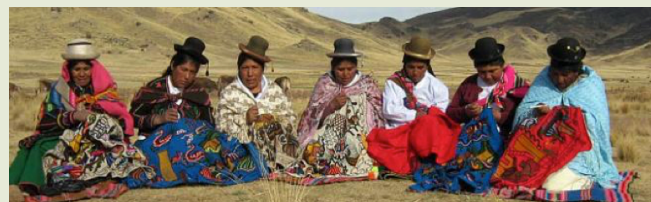
Community women, embroidering wool tapestries, for an artisan project revived by the Chijnaya Foundation.