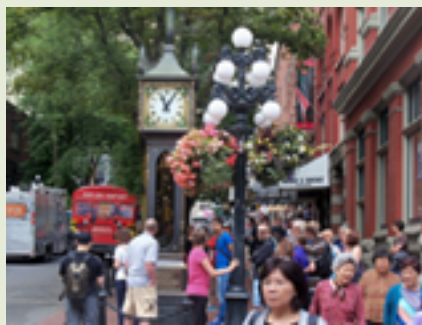
Gastown, historic heart of design, food, culture and fashion, downtown Vancouver, B.C., photo credit: Erve Chambers

1970, occurred many miles north of Vancouver Island on Campbell Island among the “Bella Bella” people (now called by themselves, Heiltsuk). They were first visited by an anthropologist named Franz Boas, early 20th century. My primary source of ethnohistorical information was an elderly Heiltsuk