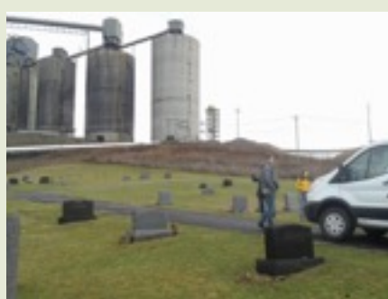
SfAA 2015 Fracking in the Coalfields Tour

As we saw at the Pittsburgh meetings, many regions of the world have experienced similar complicated relationships to extraction industries and its infrastructural build-out. Recognizing this, the SfAA/AAA "ExtrACTION" Topical Interest Group has once again been invited to develop a dedicated track of panels for the 2016 meetings. We seek preliminary proposals for panels, workshops, and independent papers on the topic of resource extraction. Reflecting SfAA's continuing commitment to diversify its scholarly community, we welcome submissions from a wide range of disciplines, geographies and communities. Topics may include: