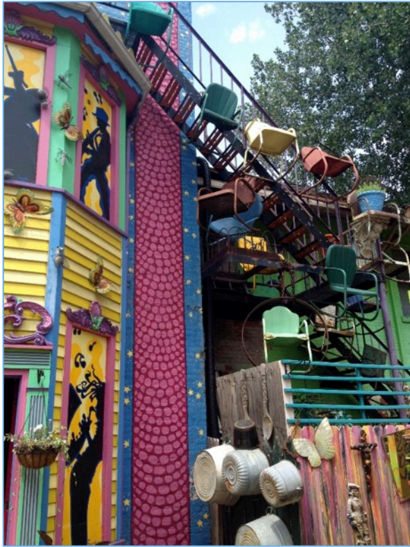
My cell phone photo of Randyland

While in Pittsburgh, walk through the historic Strip District, the parallel thoroughfares of Penn Avenue and Smallman Street (roughly between 16th and 26th Streets). The area has transformed from a factory district into a sprawling neighborhood marketplace with international food kiosks that serve Middle Eastern kebabs, Italian sausages, Greek baklavas, and Polish pierogis. After sampling the sounds, aromas, and food on the Strip, take a break with a cup of coffee at La Prima Espresso. You may also want to take a short bus ride to Oakland and breathe in the palatable energy emanating from the University of Pittsburgh and the nearby the renowned Carnegie Museum of Art and Carnegie Natural History Museum with their impressive collections that range from fine arts and