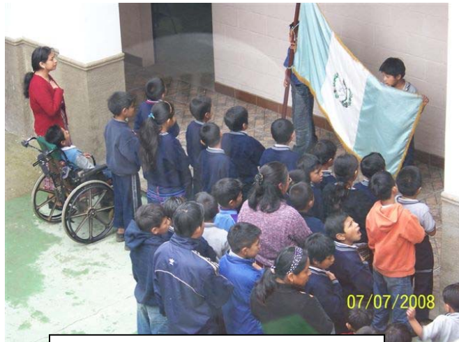
Occupational justice focuses on the right to participate in a society's valued activities

emotional or developmental differences. The field school faculty, students and guest lecturers will participate in weekly integrative seminars. The field school program also provides for daily Spanish language instruction at each student's pace and level.