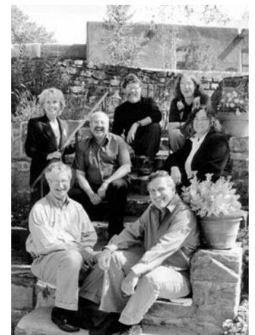
Participants in the 2002 SAR Seminar

To date, four plenary sessions have been conducted, which have resulted in the publication of three books by SAR Press. A fourth book is currently in press. Below is a complete list of the seminars, plenary sessions, and books resulting from this