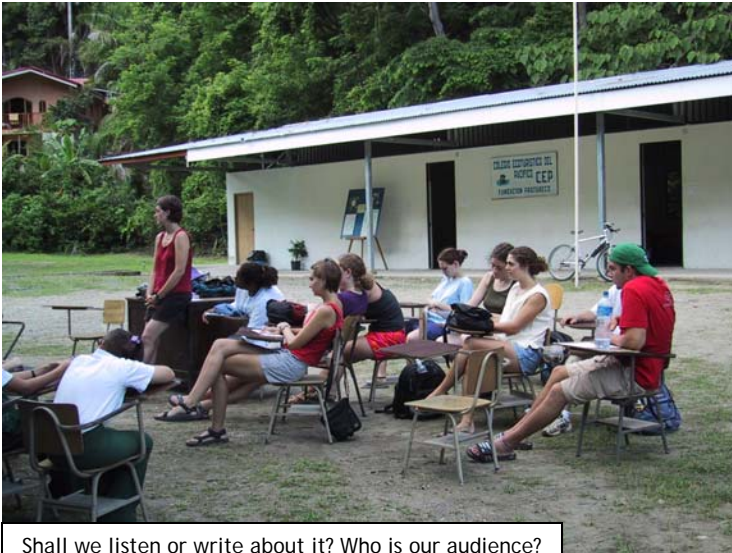
Shall we listen or write about it? Who is our audience? Quepos, Costa Rica, 2001