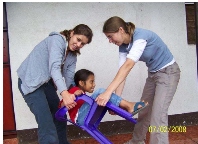
Low technology, sustainable treatment can help a rural Guatemalan child to participate meaningfully in family routines.

history methods, disability rights and feminism, and, most recently indigenous and postcolonial issues (See Human Organization , Winter 2008).