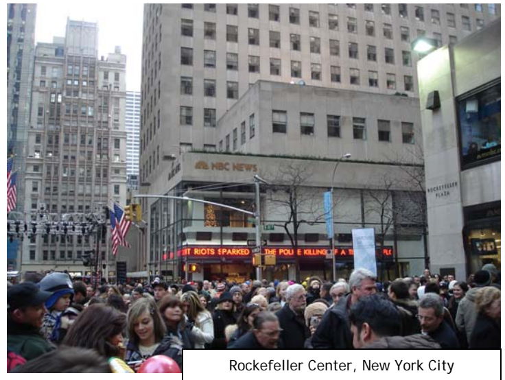
Rockefeller Center, New York City

Too many academic anthropologists are marooned in the coffin-boxes of university classrooms, their pearls of wisdom echoing wistfully off of hermetically sealed-walls. Paradoxically, just outside of campus bounds, local TV and radio programs - which can potentially educate millions - are staffed by their freshly minted (and inexperienced) former students! These are campus graduates of journalism, broadcast communications, speech, and/or theater programs where they were groomed in the practical arts of elocution and head bobbing for the airwaves and/or TV cameras. According to the FCC, these are supposed to be democratic public airwaves. But in practice, under corporate hegemony, they are mostly off limits to Ph.D.s, social scientists and even investigative journalists, i.e. thinkers and social critics. Anthropologists must fight for access to these spaces. Meanwhile they must circulate their voices in a multitude of public fora in local newspapers, the alternative press, the Internet, public television and public radio.