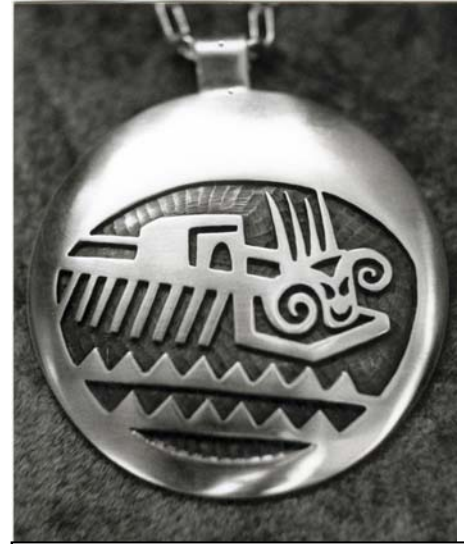
Malinowski Award Medal