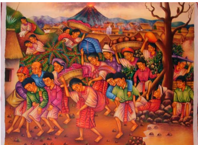
Volcano Atitlán Eruption, Artist: Antonio Mendoza Coché, San Juan la Laguna, Guatemala

Apologophobia appears associated with narcissism. Stereotypical descriptions of physicians often describe