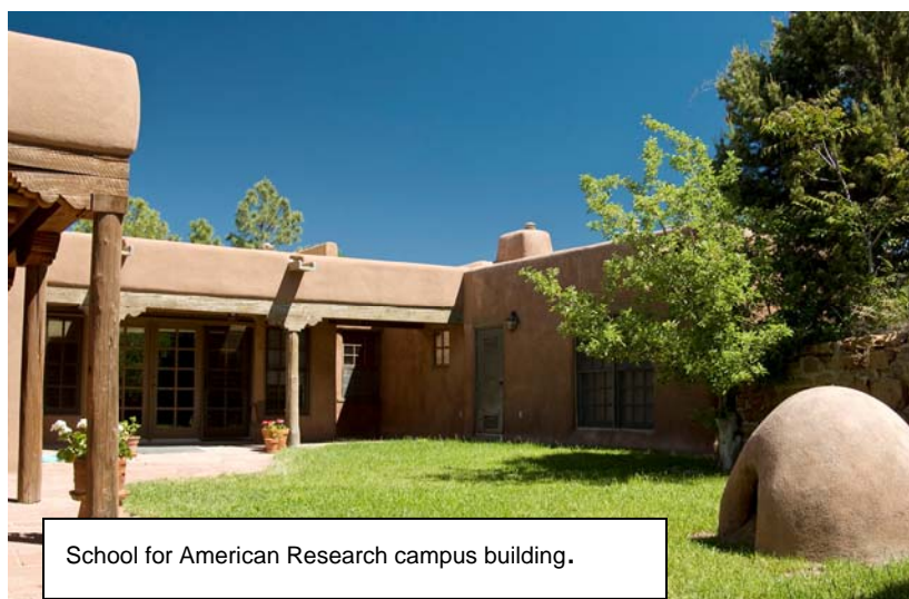
School for American Research campus building.

In July 2008, the School for Advanced Research (SAR) hosted a seminar on “Scholars, Security, and Citizenship”—subsequently renamed “Military Imaginaries, Ethnographic Realities”—as part of a collaborative arrangement with the Society for Applied Anthropology. Nine scholars met at SAR to discuss the papers to be presented at the 2009 plenary session on March 19 at the Society for Applied Anthropology (SfAA) meetings in Santa Fe, New Mexico (see participant list below).