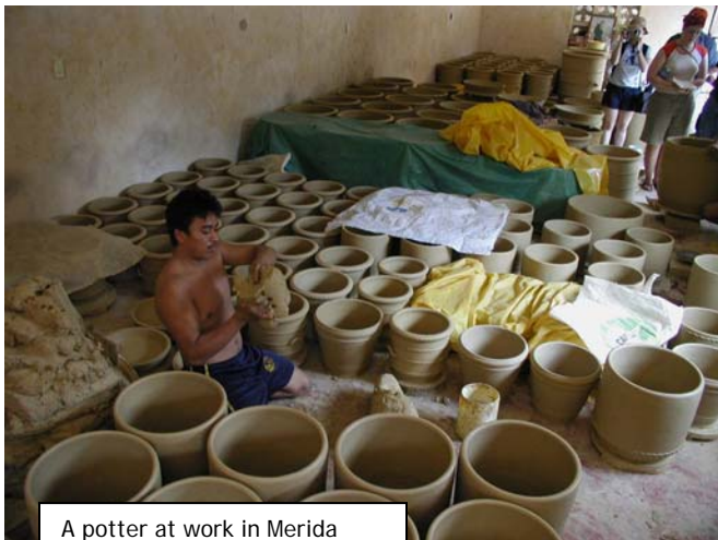
A potter at work in Merida

But at the Santa Fe meetings we are reaching a critical moment. We are all vulnerable to economic crises, cuts, layoffs, and social disruptions that occur in our own lives and throughout the world under the worsening world economy. The Society was formed by social scientists in 1941 at the cusp of World War Two when a recalibration of anthropology and other applied social sciences was needed. Here we are again. We have an urgency to do something both personally and through the Society, to recalibrate our efforts and our commitments. We have made a positive difference through applied work, and we have an urgency to continue to do so in today's context.